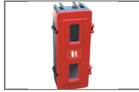
FIRE EXTINGUISHER CABINET