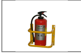
FIRE EXTINGUISHER GUARD