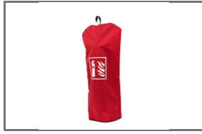
FIRE EXTINGUISHER COVER