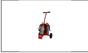
FIRE EXTINGUISHER CADDY