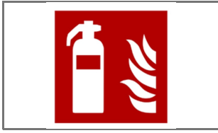
PICTOGRAM FIRE EXTINGUISHER