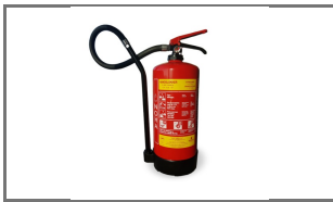
FRY FIGHTER EXTINGUISHER