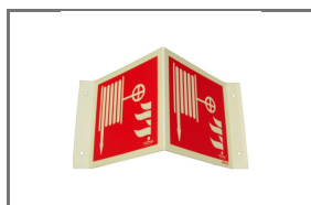
SIGN - FIRE HOSE